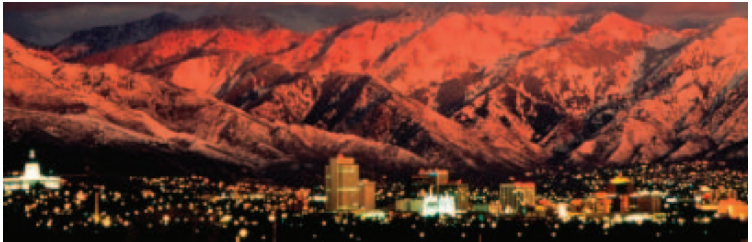
Downtown Salt Lake City