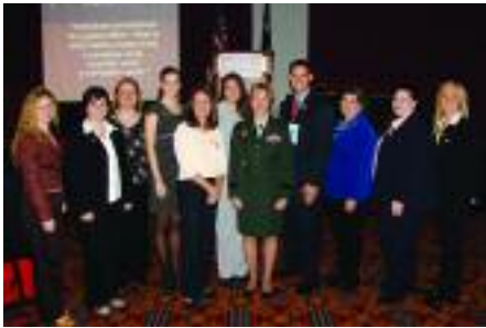
Major General Gale S. Pollock and the 2005-06 Board of Directors at the Leadership Breakfast in Louisville, KY

of Nursing at Case Western Reserve University's Frances Payne Bolton School of Nursing, and her opening presentation at MidYear promises to be a motivating start to the Conference.