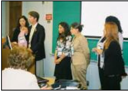
The NSNA Board of Directors presents a workshop on "Disaster Preparedness, Response, and Recovery" at the Delgado Community College Charity School of Nursing, New Orleans, LA.

Disaster Relief Fund project initiated in September 2005 by the Foundation of the NSNA (FNSNA). The Foundation has raised over $15,000 to donate to nursing