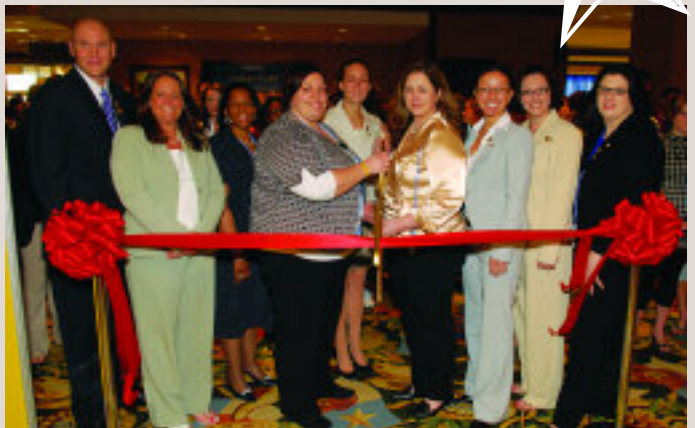
NSNA Board of Directors officially opened the Exhibit Hall with the annual ribbon cutting ceremony.

Attendees celebrated First Nite and danced, sang, and partied in true Texas style!