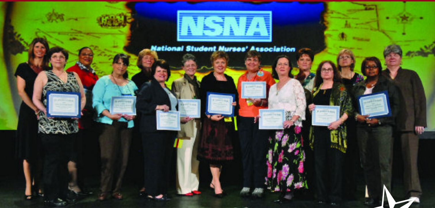
NSNA's individual and agency sustaining members are crucial NSNA supporters.