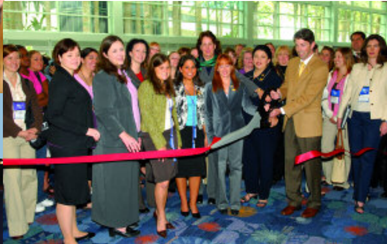
The NSNA Board of Directors officially opened the Exhibit Hall with the annual ribbon cutting ceremony.