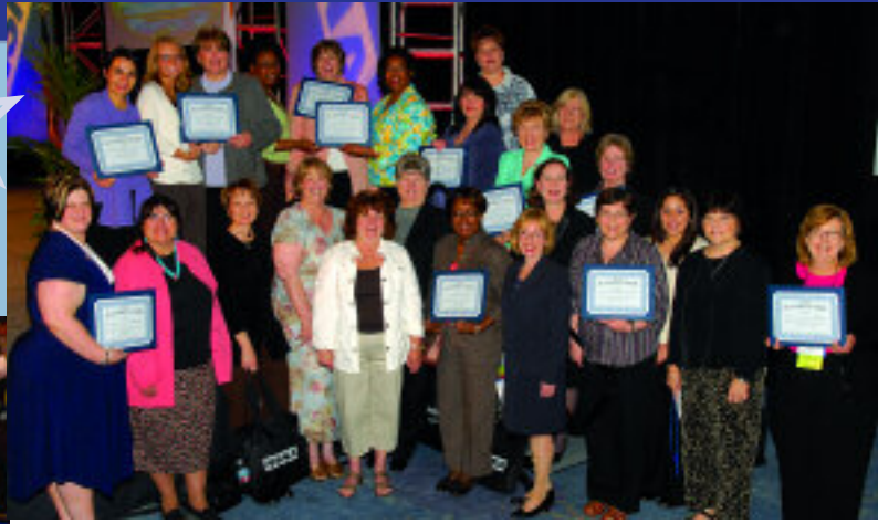
NSNA's Convention sponsors, Sustaining Members, and deans and faculty were recognized. The Sustaining Members are pictured above.