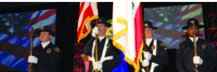
The Presentation of Colors was performed by St. Catherine's Military Academy.