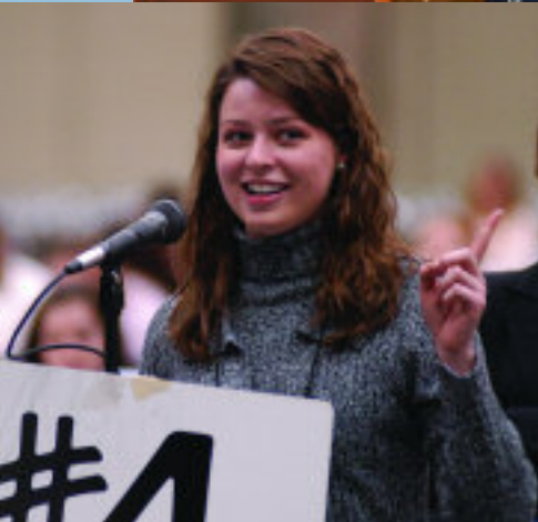
On Saturday, April 14, the House of Delegates pledged over $19,000 to benefit the Disaster Relief Fund, which is administered by the FNSNA.