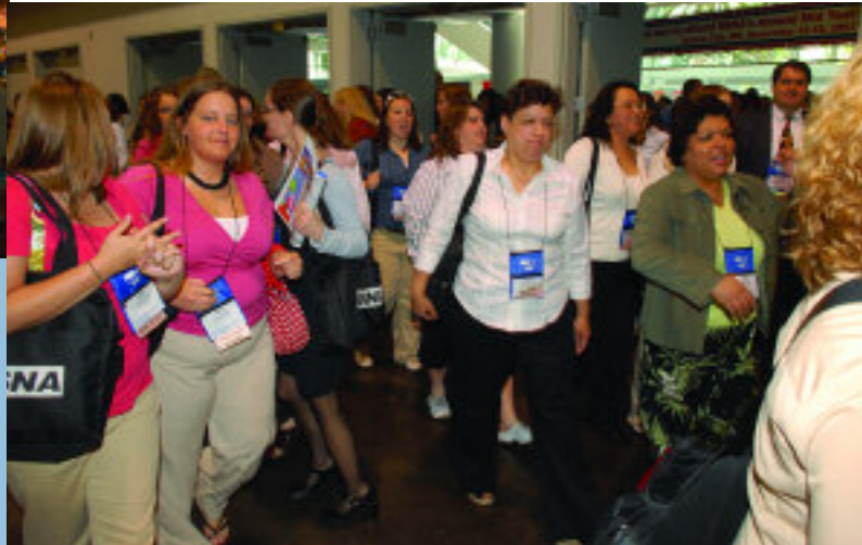
Students packed the Exhibit hall to network with health care recruiters, schools of nursing, and publishers, among others.