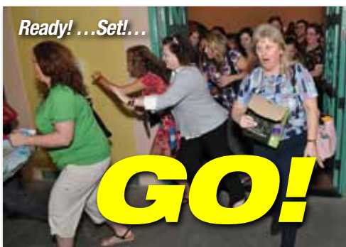
Exhibit Hall & Career Counseling Center Grand Opening!